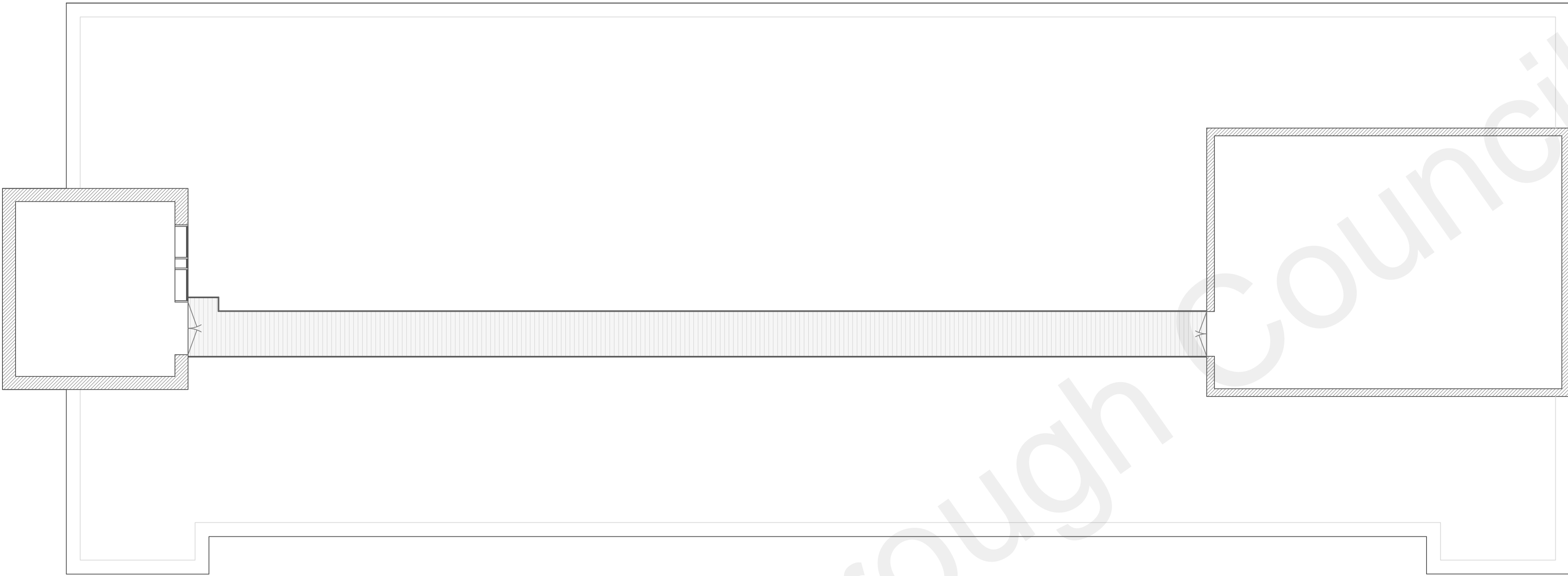
EXISTING SIXTH FLOOR PLAN