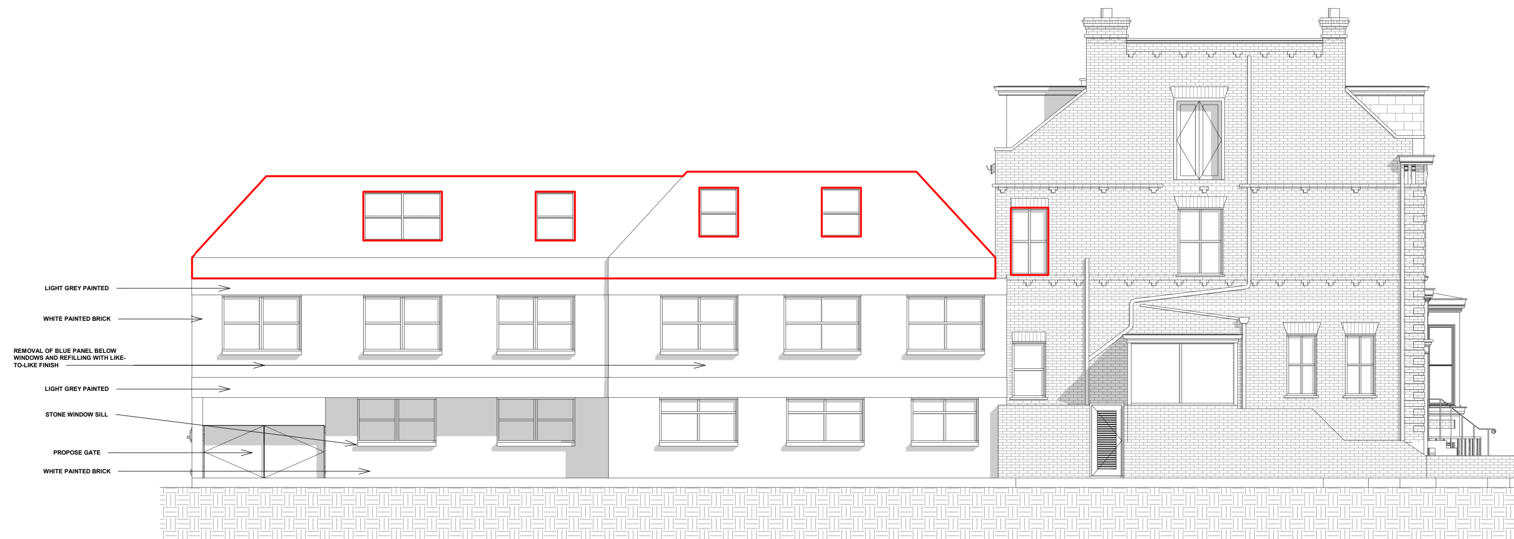
3 Proposed Left Side Elevation 1 : 100