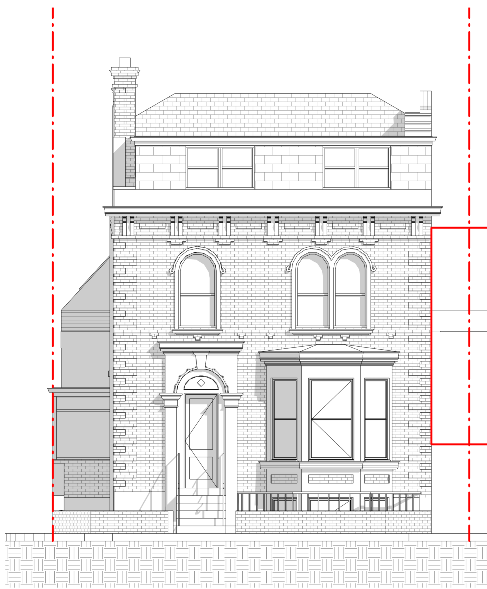
1 Proposed Front Elevation 1 : 100