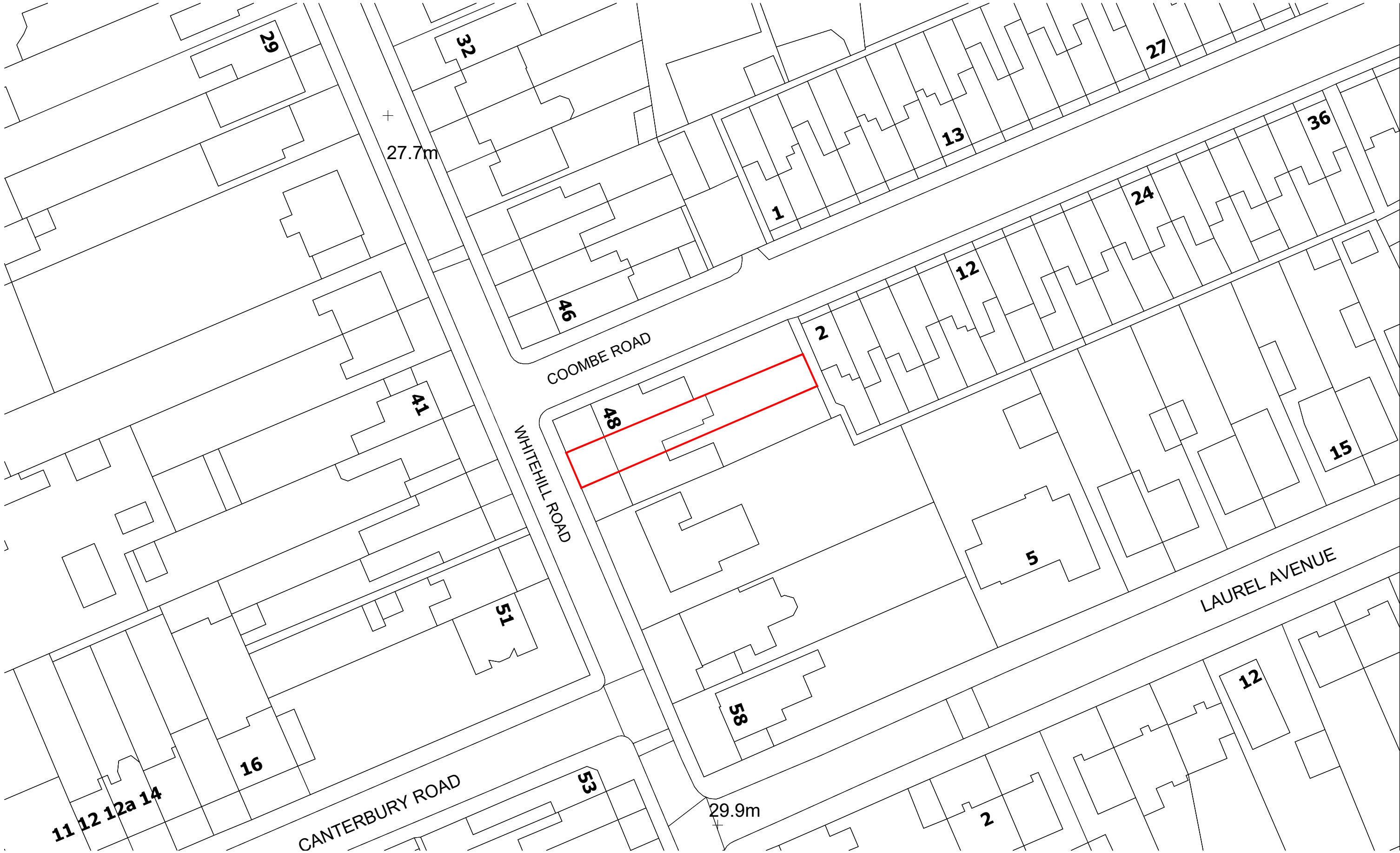
LOCATION PLAN - 1:500 @ A2

This drawing is for illustrative purposes only. All drawings must be reviewed and approved by contractor, builder, engineers, including structural, electricians, fire engineers, professionals and officers for buildability, stability, planning, regulations and safety.