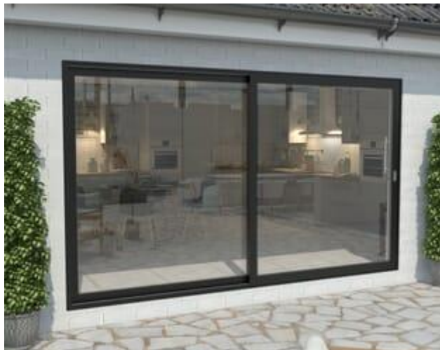
BLACK ALUMINIUM WINDOWS AND REAR DOORS