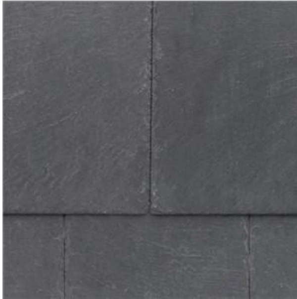
NATURAL SLATES - BLACK