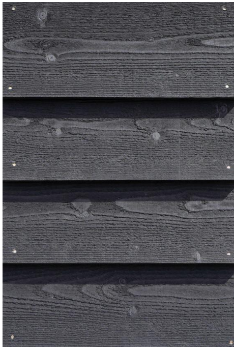
BLACK PAINTED FEATHER EDGE BOARDING