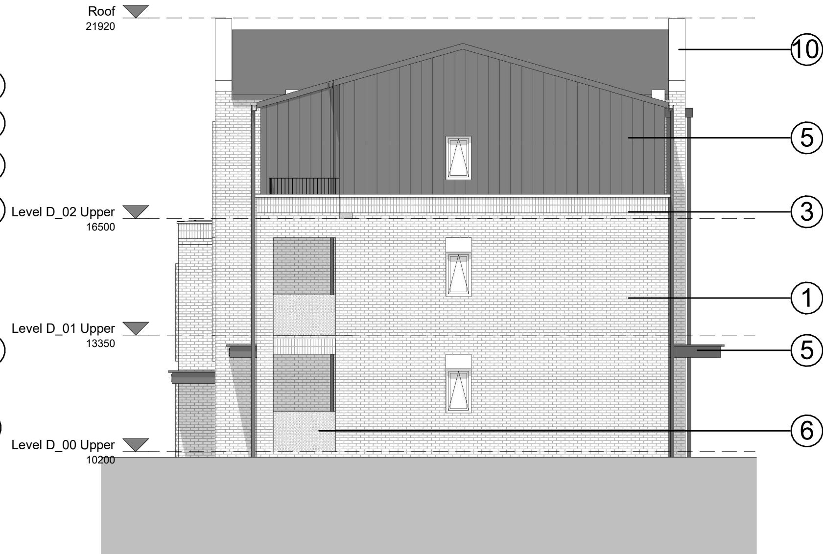
4 Block D - East Elevation 1 : 100