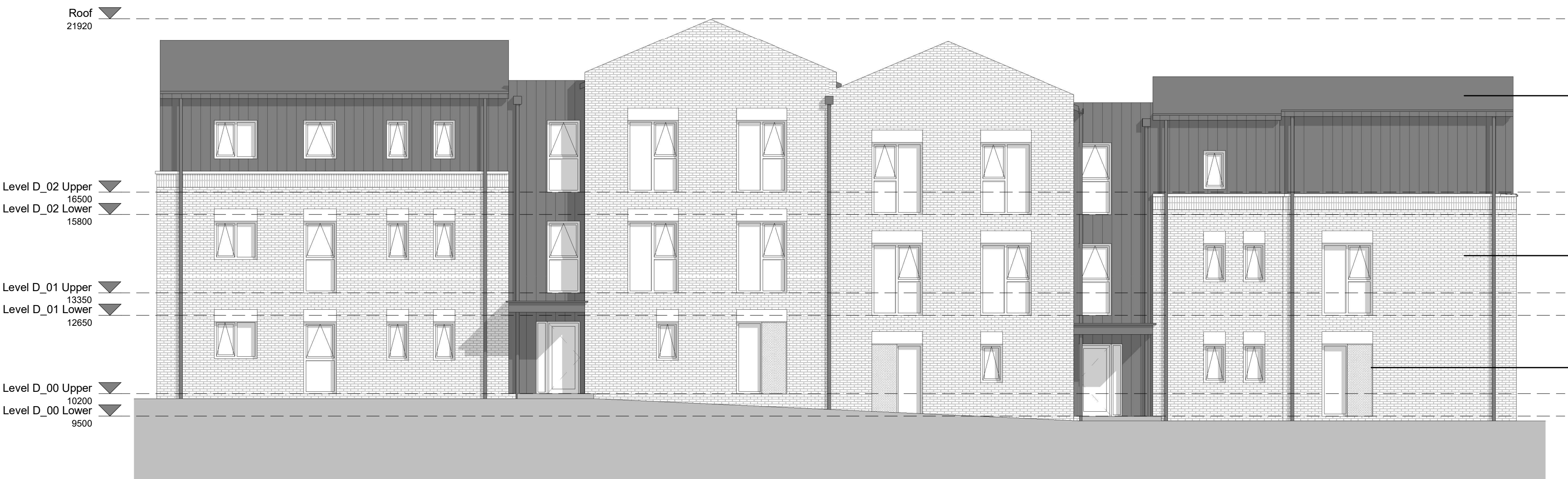
3 Block D - North Elevation 1 : 100