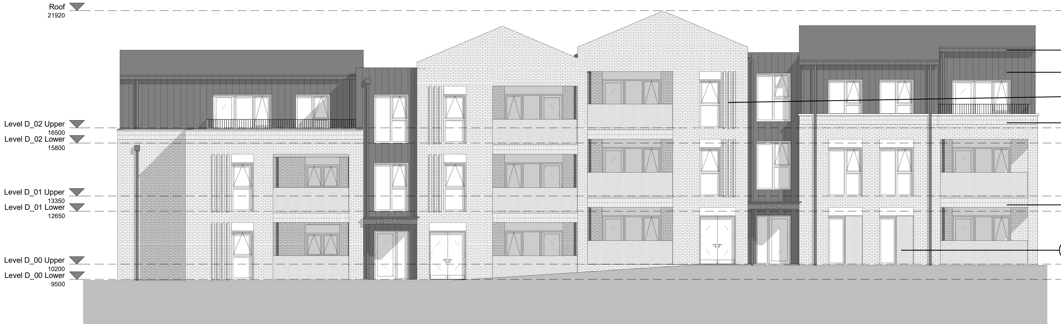
1 Block D - South Elevation 1 : 100