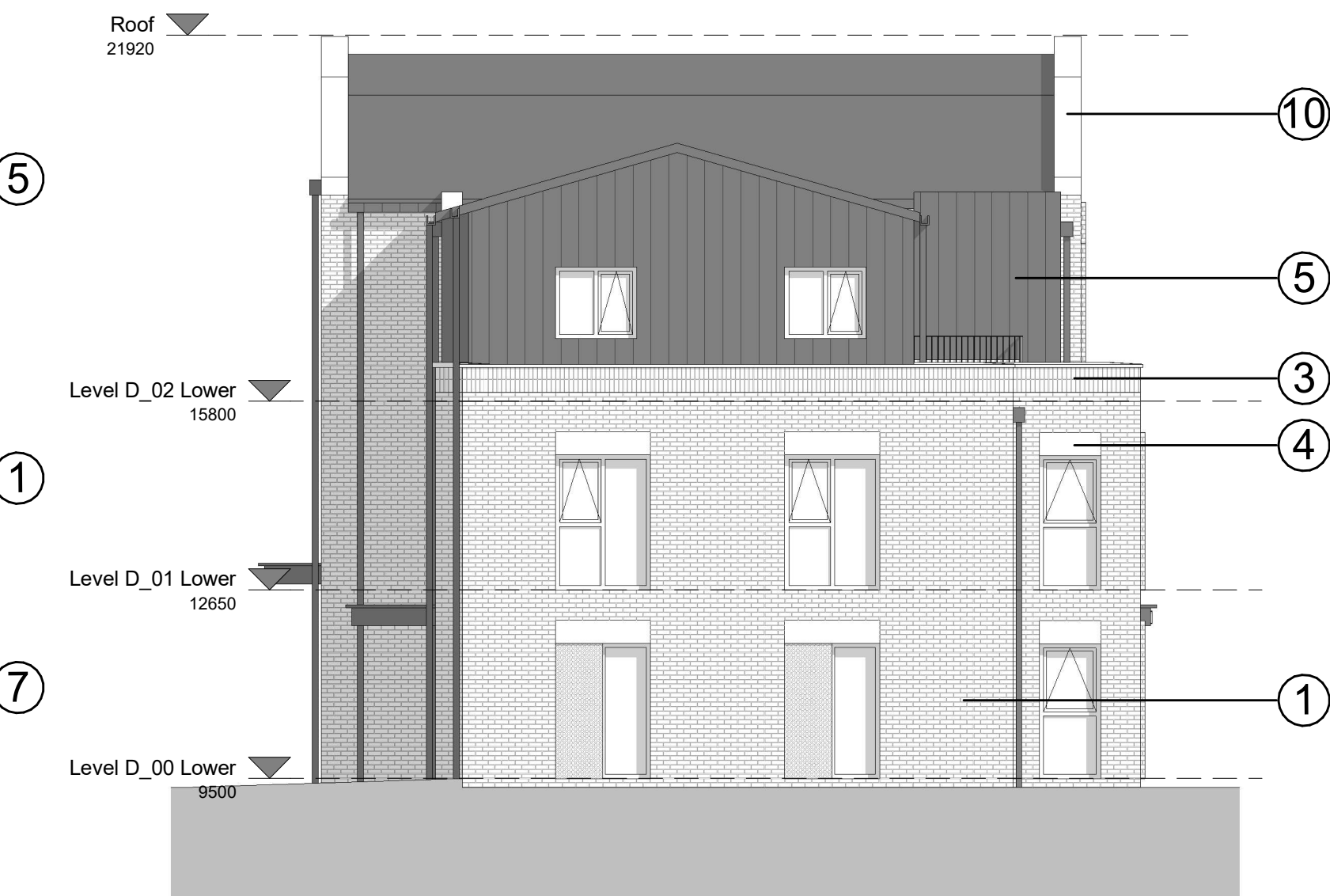
2 Block D - West Elevation 1 : 100