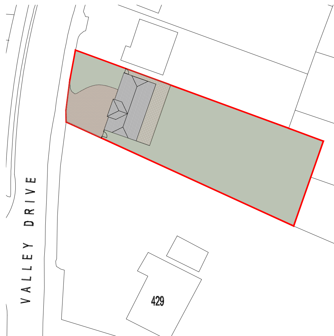
Proposed Block Plan 1:500