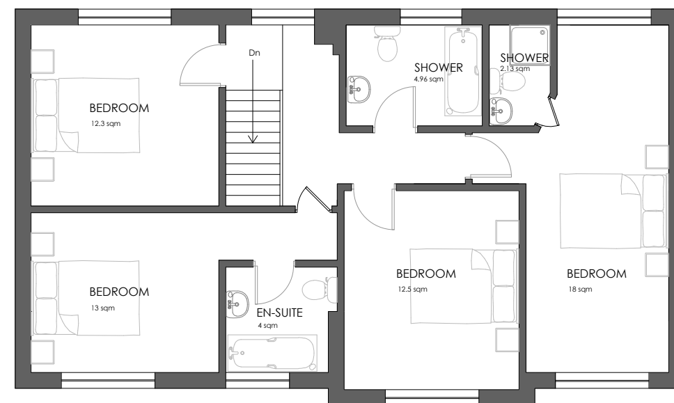
Proposed First Floor Plan