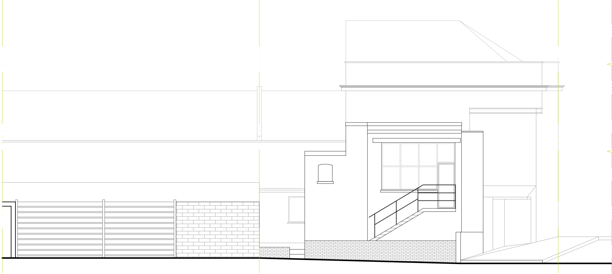
EXISTING LEFT SIDE (SOUTH) ELEVATION