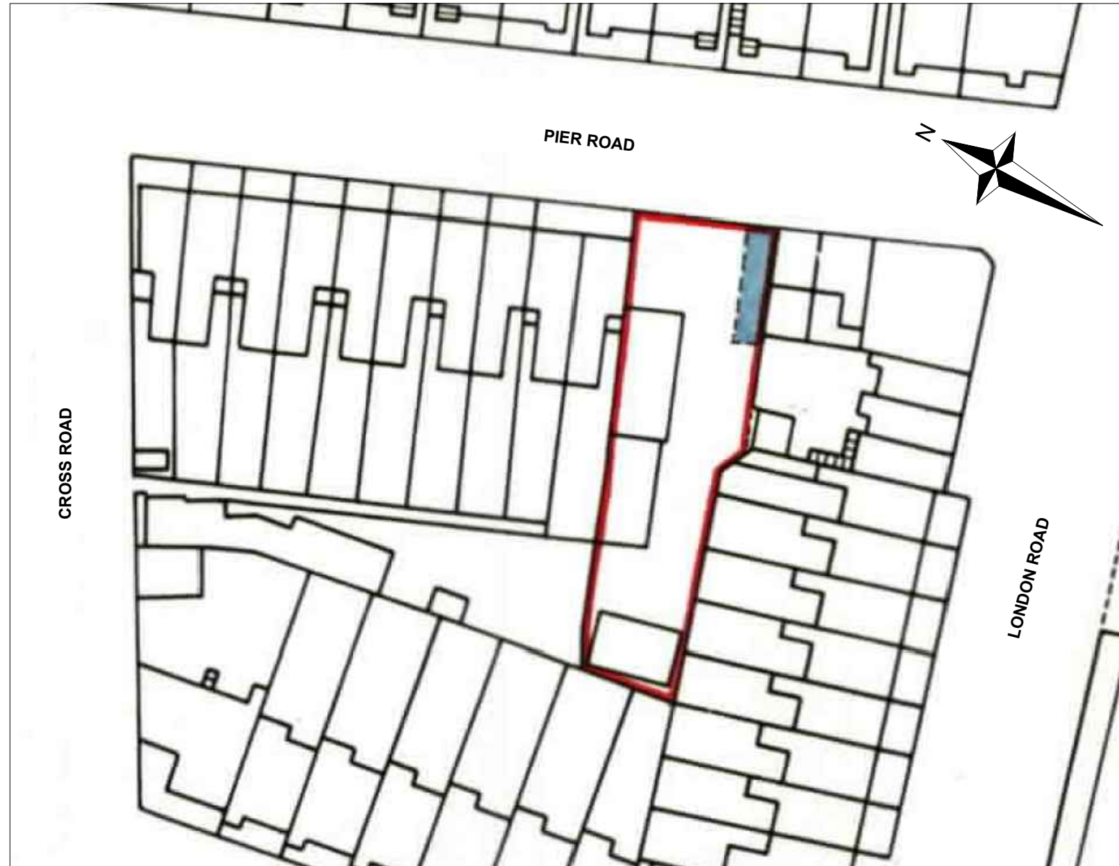
EXISTING BLOCK PLAN SCALE-1:500

MATCHING MATERIALS TO BE USED FOR FLATS. FLATS TO BE TILE HUNG WITH MATERIALS TO MATCH EXISTING. ALL DIMENSIONS IN MILLIMETERS & TO BE CHECKED ON SITE PRIOR TO COMMENCEMENT OF ANY BUILDING WORKS. FOR EXTENSION TO HABITABLE ROOF SPACE INVOLVING DEMOLITION OF EXISTING SIDE ELEMENT. THIS DRAWING IS THE COPYRIGHT OF REHAL PLANNING. IT MUST NOT BE COPIED OR REPRODUCED OR USED IN ANY WAY WITHOUT WRITTEN PERMISSION FROM REHAL PLANNING