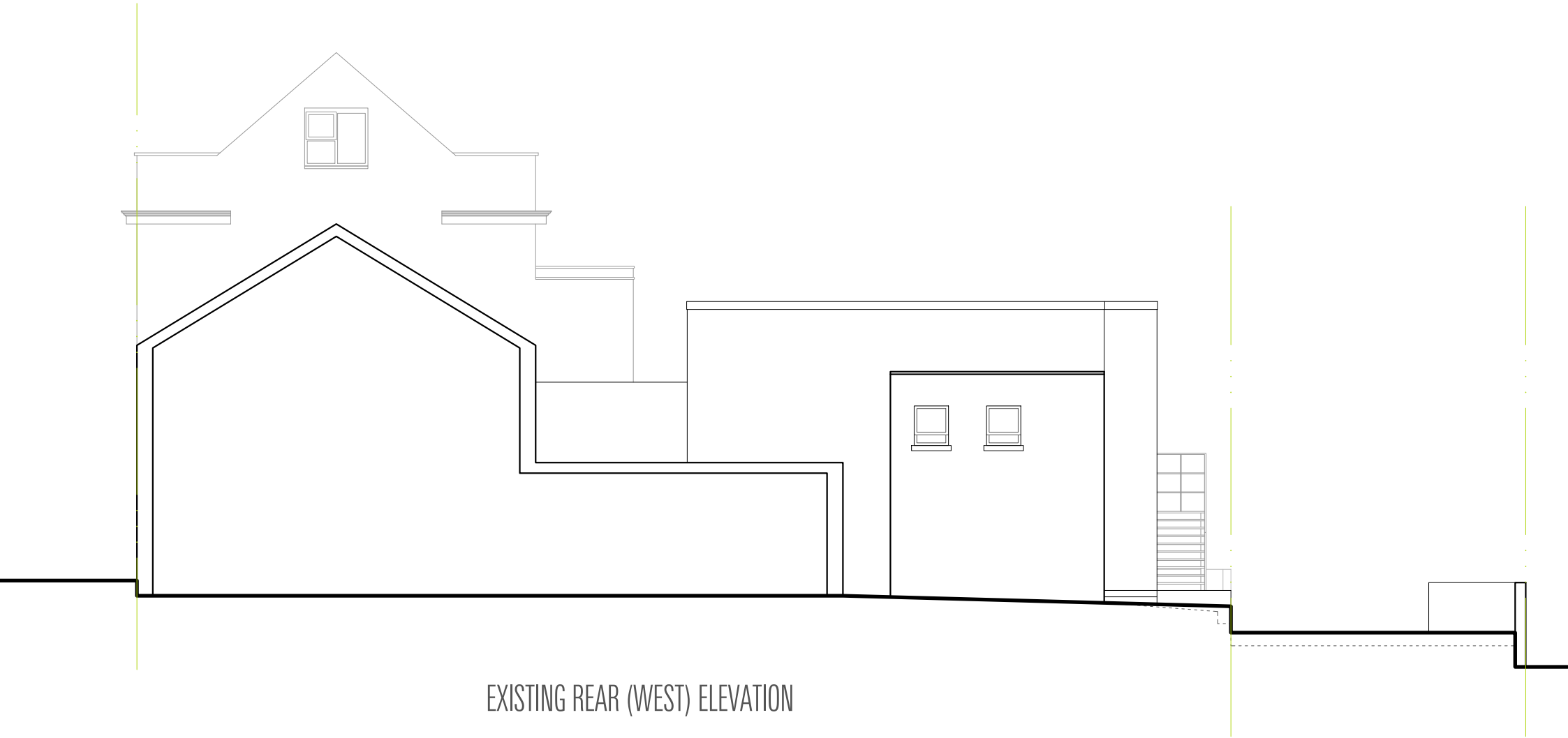
EXISTING REAR (WEST) ELEVATION